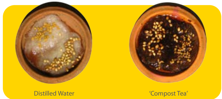
Soak a few methi and dhaniya seeds in the 'compost tea' and an equal number in distilled water for 2-3 minutes. Lay them on dampened cotton on a flat surface; keeping it moist and warm. Check the seeds every 3-4 days.