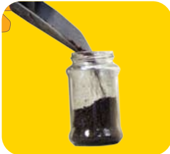
Put some compost in a bottle.