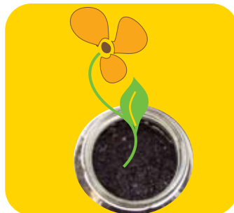
If it smells like nice wet earth, then the compost is done.

If you notice bad odors then it means that the materials in the compost were not sufficiently decomposed and anaerobic organisms have gone to work on the nutrients that remain. These anaerobes produce unpleasant odors as a by-product, so bad smells indicate that the compost is not done yet.