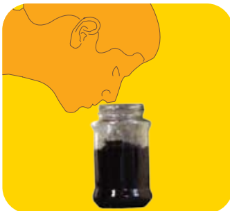
Open the bottle (carefully!) and check for odor.