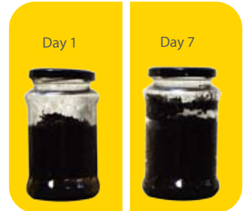
Leave it alone for a week.