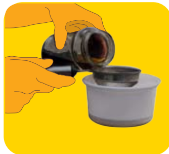
Pour the 'tea' into another container. (The remaining solids can be returned to your compost pile.)