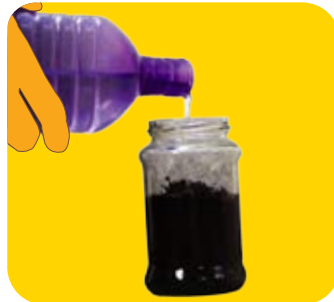
Add water to make it soggy.