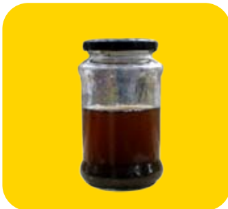
Mix equal amounts of compost and water and let it sit for five minutes while stirring occasionally.