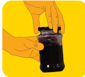
Seal the bottle tightly.