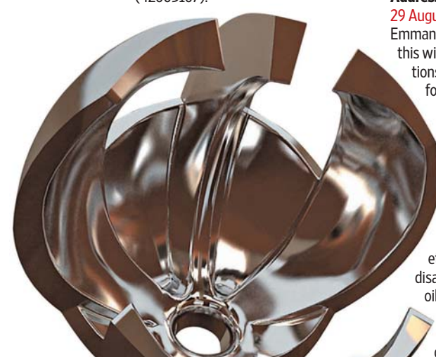
Steel sense: A Vishal K. Dar sculpture.

11am-8pm. The Stainless Gallery, Property No. 1 and 2, Ishwar Nagar, Mira Complex, Okhla Crossing, Mathura Road (42603167).